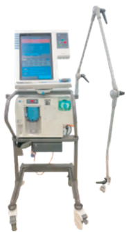
PURITAN BENNETT 840 VENTILATORS X 2