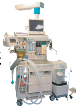
ANESTHESIA MACHINE OHMEDA AESTIV