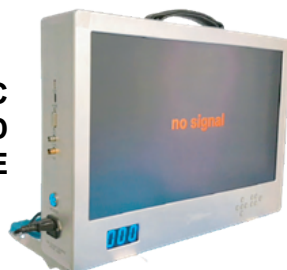
LAPAROSCOPIC CAMERA WITH CCU AND LIGHT SOURCE